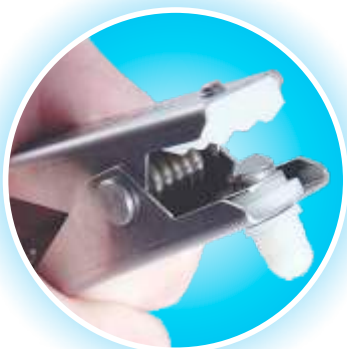
ATEX approved model shown