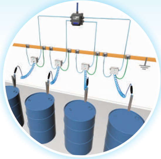
Ideal for Drum Dispensing Applications

The FM approved Bond-Rite REMOTE (EP) in Stainless Steel can power 3 indicator stations simultaneously.